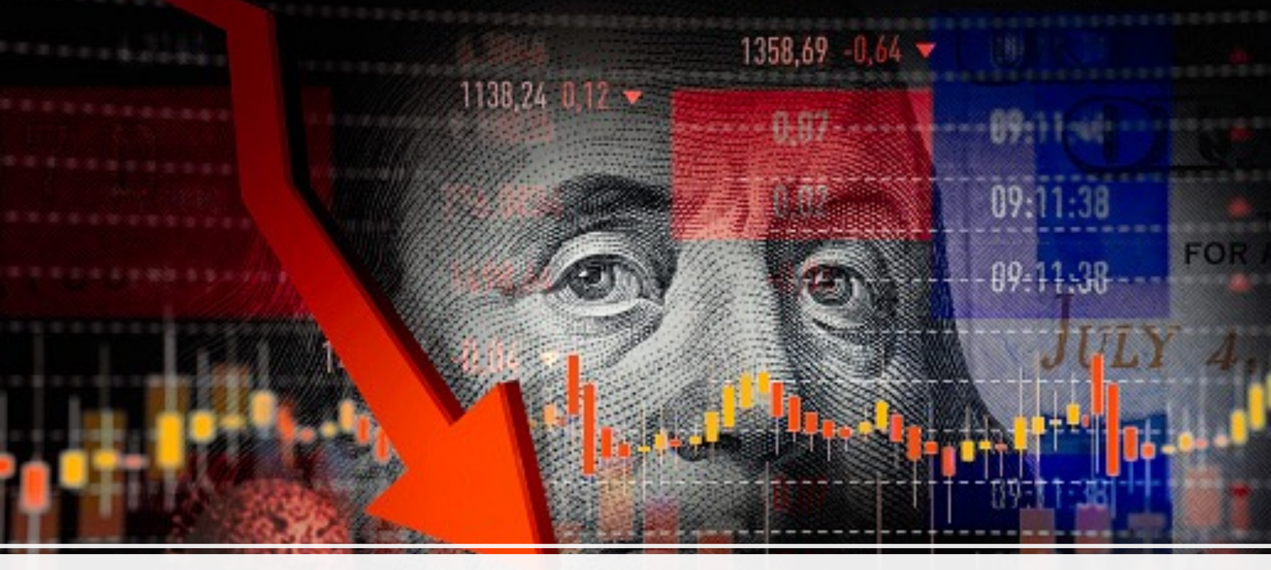
Financial Crisis - SIGNS